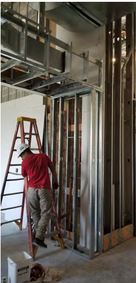
Week 6, October 10 th , construction worker tending to the work around a fur down in the genealogy, library, and research room.