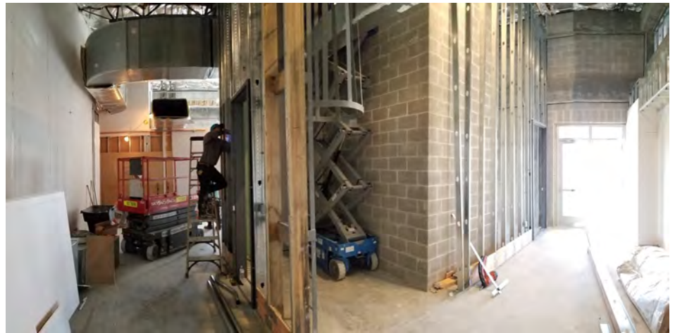
Above: Week 5, October 3 rd , another panoramic view, but of the rear entrance, going around where the elevator is located, and looking at the side entry into the genealogy, library, and research room.