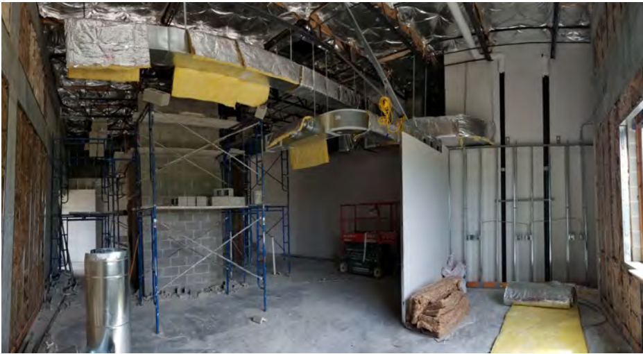
Week 4, September 29 th , a panoramic shot of the genealogy, library, and research room.